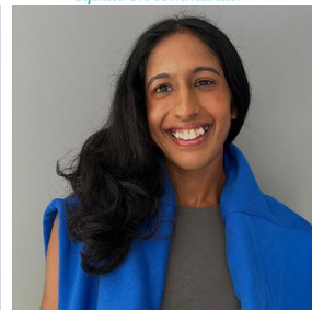
SHANTI PEREIRA Singapore's sprint queen