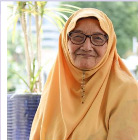
SALEHA MOHAMED SHAH Trailblazing magazine editor