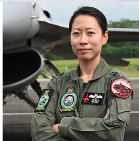
LEE MEI YI Singapore's first female fighter squadron commander