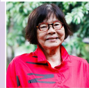
SYLVIA TOH PAIK CHOO Pioneering humour writer and the Grandmother of Singlish