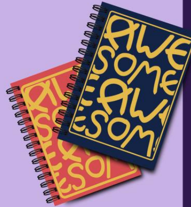
AWESOME NOTEBOOK $25