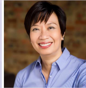
OVIDIA YU Internationally acclaimed novelist and playwright